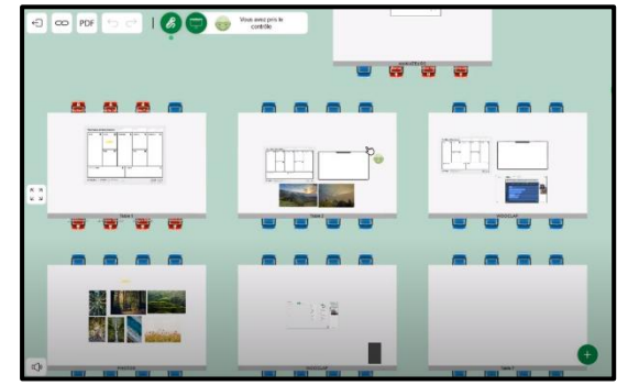
Figure 1. Presentation of the virtual room for the ideation sessions

The objective of the ideation sessions is to provide specialized support to participating SMEs so that they can discuss and develop solutions or services in partnership. In line with the objective of the project, it will be necessary to establish the most favourable environment for exchanges and to animate discussions.